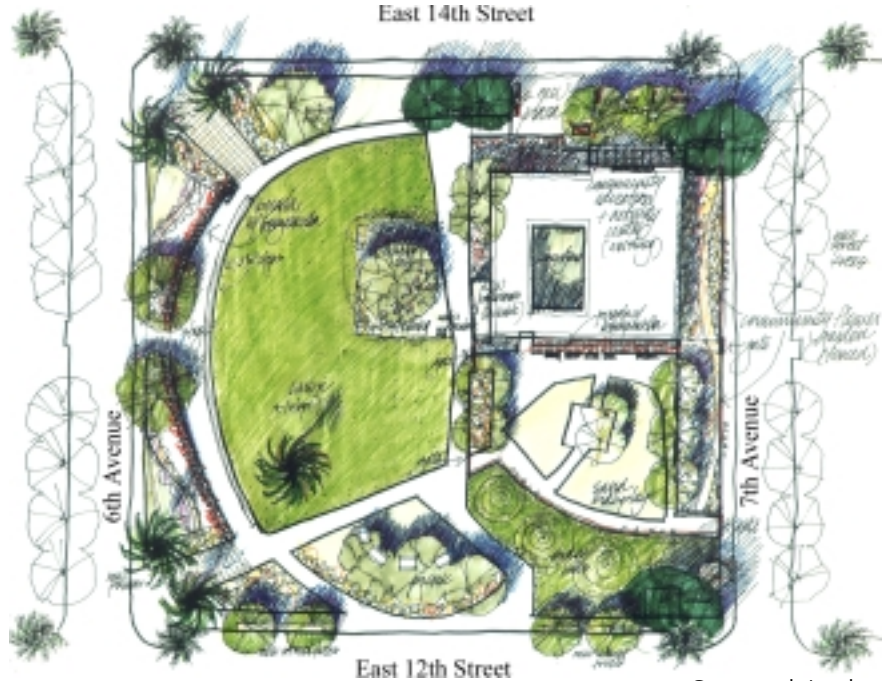
Conceptual site plan.