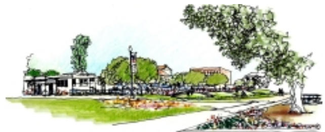
Children's play space and picnic area.

When rehabilitated and maintained, Clinton Park will once again be a source of neighborhood pride and a center for community activities, reflecting the ethnic groups that give Eastlake its character. Incremental public improvements are intended to act as a catalyst for community development. EBALDC and ELMA are currently undertaking the park improvements.